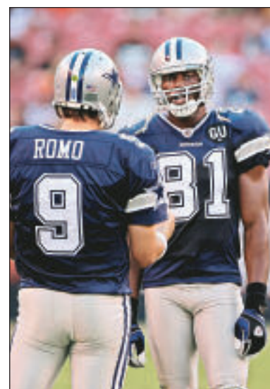
Dallas Cowboys wide receiver Terrell Owens (right) talks to quarterback Tony Romo during a game against Cleveland. Speculation abounds about a rift between the two stars, but it's the Cowboys' defense that is failing to meet expectations.